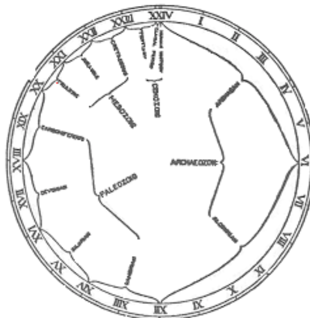
DIAL OF THE COSMIC DAY - AGE OF THE EARTH